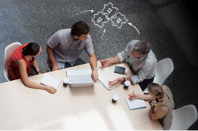
Cloud Hosted Dispenser(s) Monitoring Solution