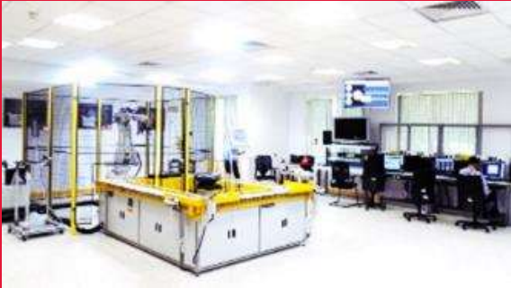
Factory of Future Lab, Bangalore