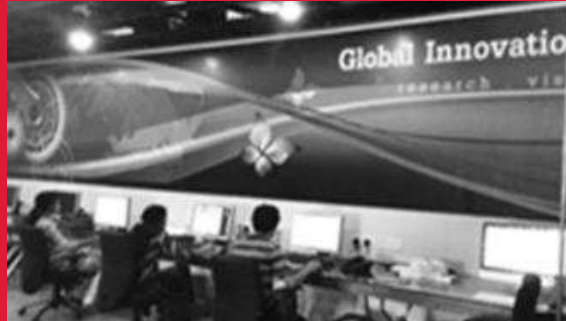
MaGIC Lab, Chennai