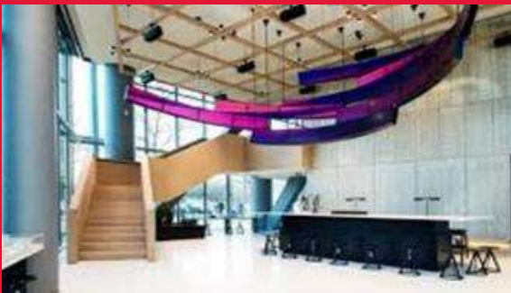
IoT Co-Innovation with IBM, Munich