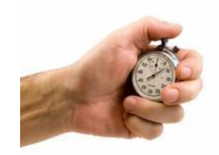
Faster & Cheaper